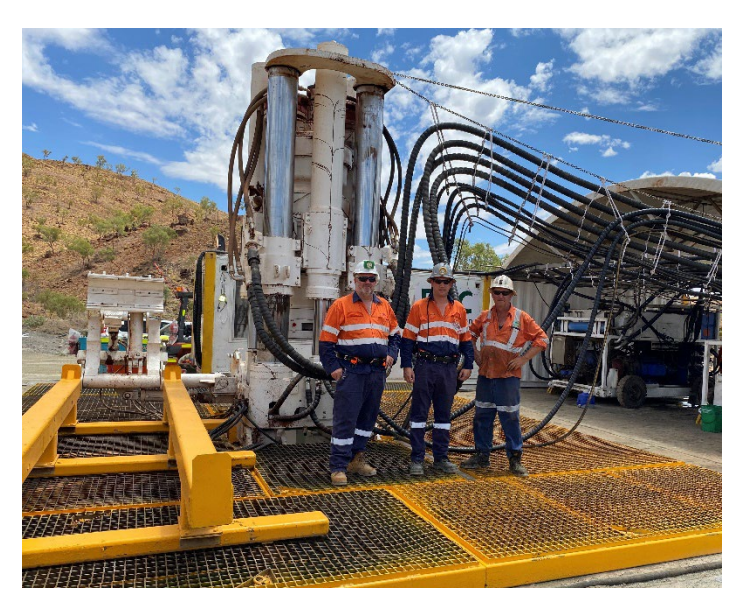
Figure 2: Development breakthrough into FAR #3