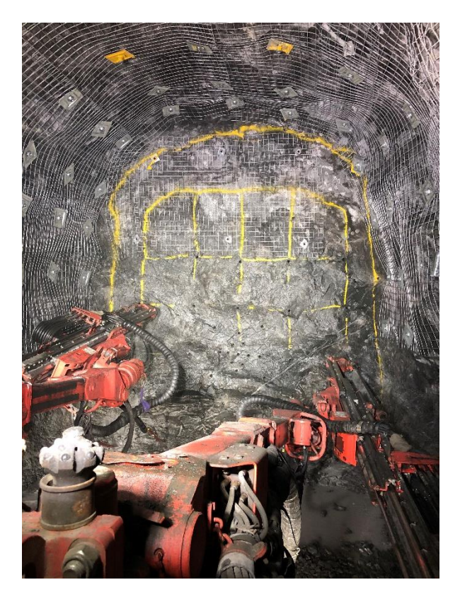
Figure 1 & 2: FAR 3 Development Drive and current face