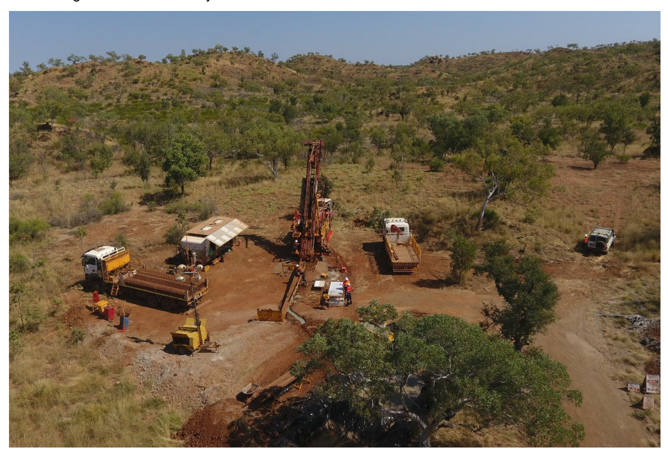
Figure 1: Surface drilling on the Stoney Creek prospect at Savannah Nickel Mine May 2022

A planned DHEM survey of SMD188 was unsuccessful due to hole casing issues. However, subsequent EM soundings and fixed loop electromagnetic (FLEM) surveys completed over the intrusion has identified a strong, discrete anomaly at depth below the intrusion. This anomaly, which has been modelled (Figure 2) as a steep west dipping conductor oriented sub-parallel to the eastern margin of the intrusion, is the current target for the new Stoney Creek drill hole.