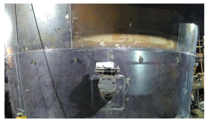
Figure 3: Photo showing progress of repairs to the Roaster. New plates have been welded to form a shell around the damaged area of the Roaster as depicted in Figure 2