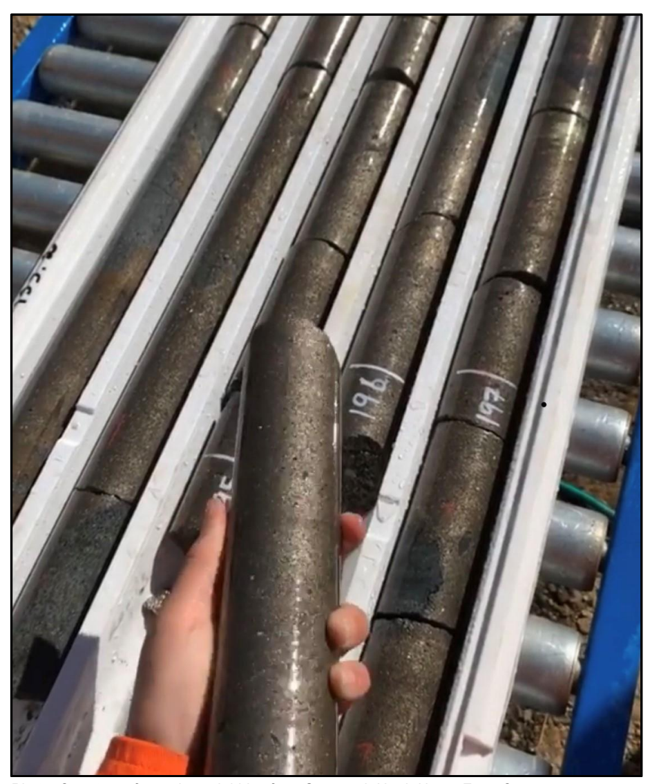
Photo: Core tray of massive sulphides from Savannah North Upper Zone Crown area

The Savannah North Ore Reserve infill drilling commenced in June, with 9,298 drill metres completed in the quarter. The infill drilling program is concentrating on the areas above and below the Savannah North 1381 Level, the first production level to be developed. The balance of the drilling is focused on the Savannah North Upper Zone crown area at the upper limit of the known resources. The drilling to date has generally returned better than expected widths and grades (refer to the Company's ASX announcement of 10 October 2019 for drilling results and JORC (2012 Edition) Disclosure Tables).